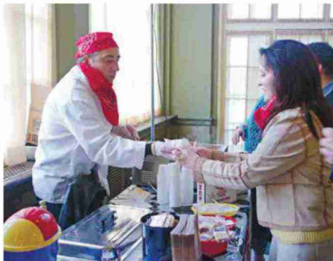
From the 2011 Chili Fest

Snyder at 817-7269, or visit buffalochilifest.com .